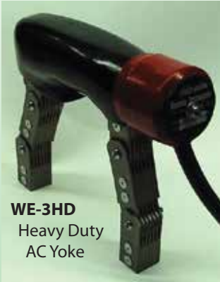
WE-3HD Heavy Duty AC Yoke

The WE-3HD is not our lowest price Yoke, that position is held by the WE-3, which uses the same low cost power cord and strain relief as competitive Yokes.