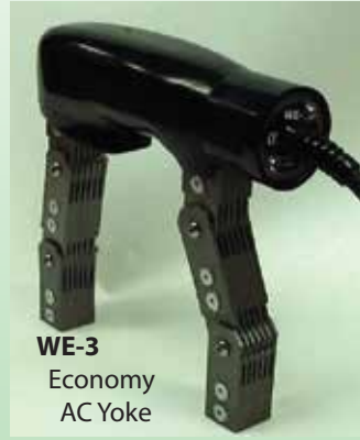
WE-3 Economy AC Yoke

Voltage: 115 and 230 VAC Nominal (60r12VDC) Models: WE-3 / WE-3HD (115 Volt) WE-3 / WE-3HDK (230 Volt) Current: 4.0 Amps (115V), 2 Amps (230V) Frequency: 50 or 60Hz