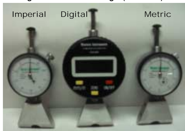
The Pocket Pit Gauge

Thus, in our Range of 11 different models of Dial Pit Gauges, from the Basic Pit Gauge through to our advanced Bridging Pit Gauge Systems, there are actually 33 models! Chances are we have a knowledgeable Stocking Distributor in your region, so contact us for assistance with your application, and contact information for a dealer