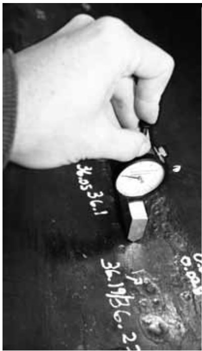
Assuring compliance with Specifications for Corrosion & Erosion Depth Measurement.