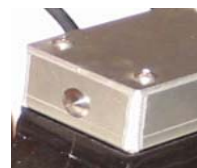
WA-Series Coil with Energize Button, on Control Housing.