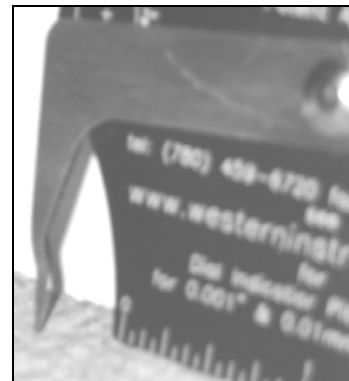
Pointer Offset Correction