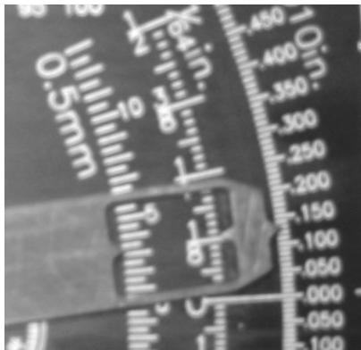
Pointers for all Three Scales

The Tri-Gauge® offers a Depth / Height range of \pm 12.5\text{mm} ( 0.500'' ), with an accuracy of 0.5\text{mm} or a little finer with \pm 0.010'' . The Jr. Tri-Gauge® offers a Depth / Height range of \pm 3\text{mm} ( 0.100'' ), with an accuracy of 0.5\text{mm} or a little finer yet at \pm 0.005'' . Both models are fitted with a Patented Pointer Offset Correction for improved accuracy and repeatability by reducing parallax. Lever Pit Gauges are intended to Evaluate Corrosion, and not as an absolute measuring tool.